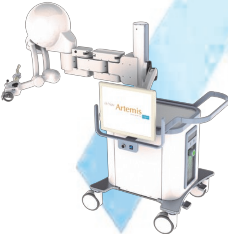
Artemis robotic biopsy imaging device

The Artemis is a robotic biopsy imaging device. Until its arrival there have been few changes in the last twenty-five years in the way prostate biopsies are administered, the device offers a significant leap forward in the detection and treatment of prostate cancer. Soon it is to be available on a global scale to help save lives.